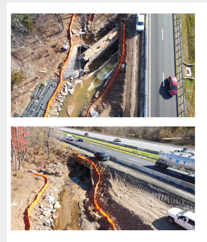
MC428 - With APAC Mid Atlantic as the Prime, we aided in building a small extension along the future I-74 Winston-Salem Northern Beltway